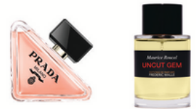
ULTIMATE LAUNCH Prada, Paradoxe & Frédéric Malle, Uncut Gem