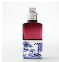
BEST NEW DESIGN & PACKAGING Dries Van Noten, Soie Malaquais