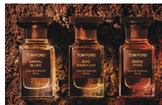
BEST NEW FRAGRANCE COLLECTION Tom Ford Enigmatic Woods Collection